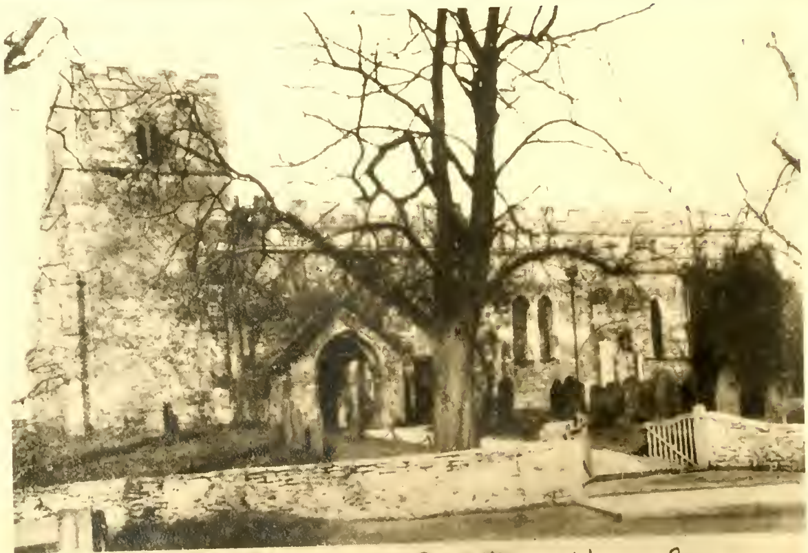
St Lawrence Church, Frodingham Frothingham Rectory instd A.D. 1236